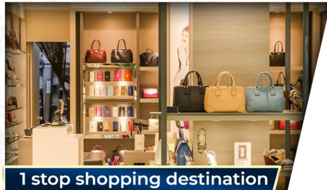
1 stop shopping destination