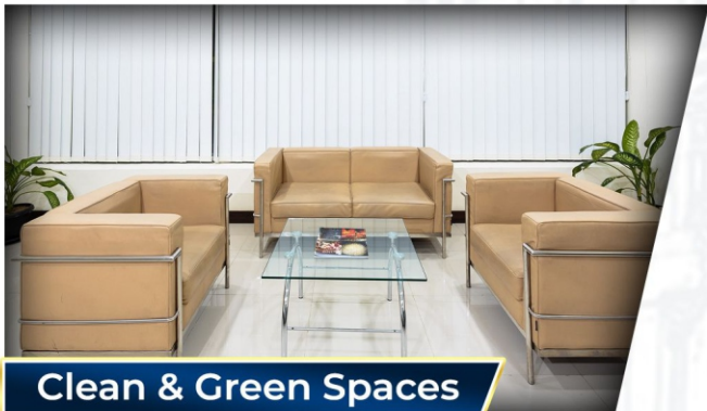
Clean & Green Spaces